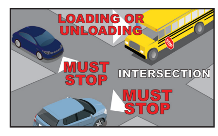
You MUST STOP at an intersection, whether it is or is not marked with a stop sign. All traffic MUST stop.