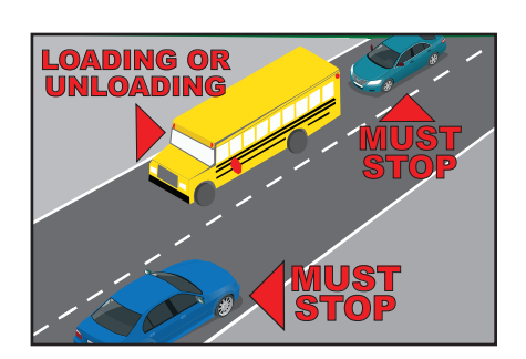
You MUST STOP on roadways with or without painted lines.