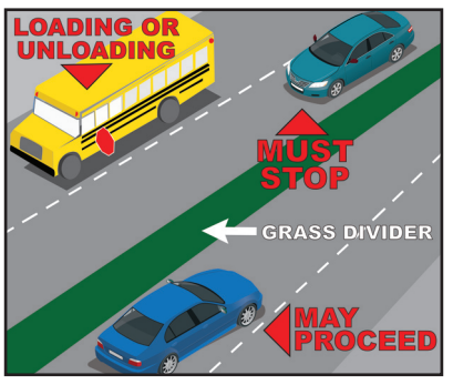
Clearly indicated dividing sections include trees or shrubs, rocks or boulders, a stream, grass, etc.