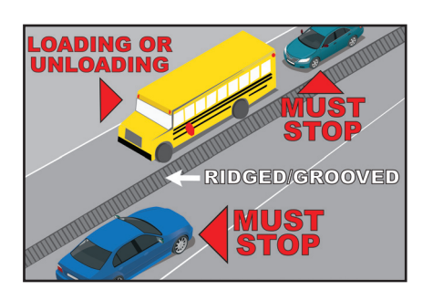
You MUST STOP on roadways with ridged/grooved dividers.