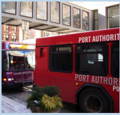
Mobility & Efficiency